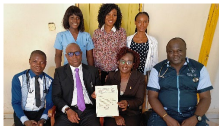
Olabisi Onabanjo University Teaching Hospital, Nigeria