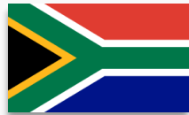
Prof Liesl Zühlke South Africa