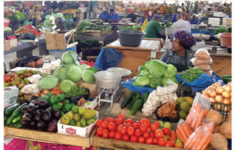
Maputo vegetable market